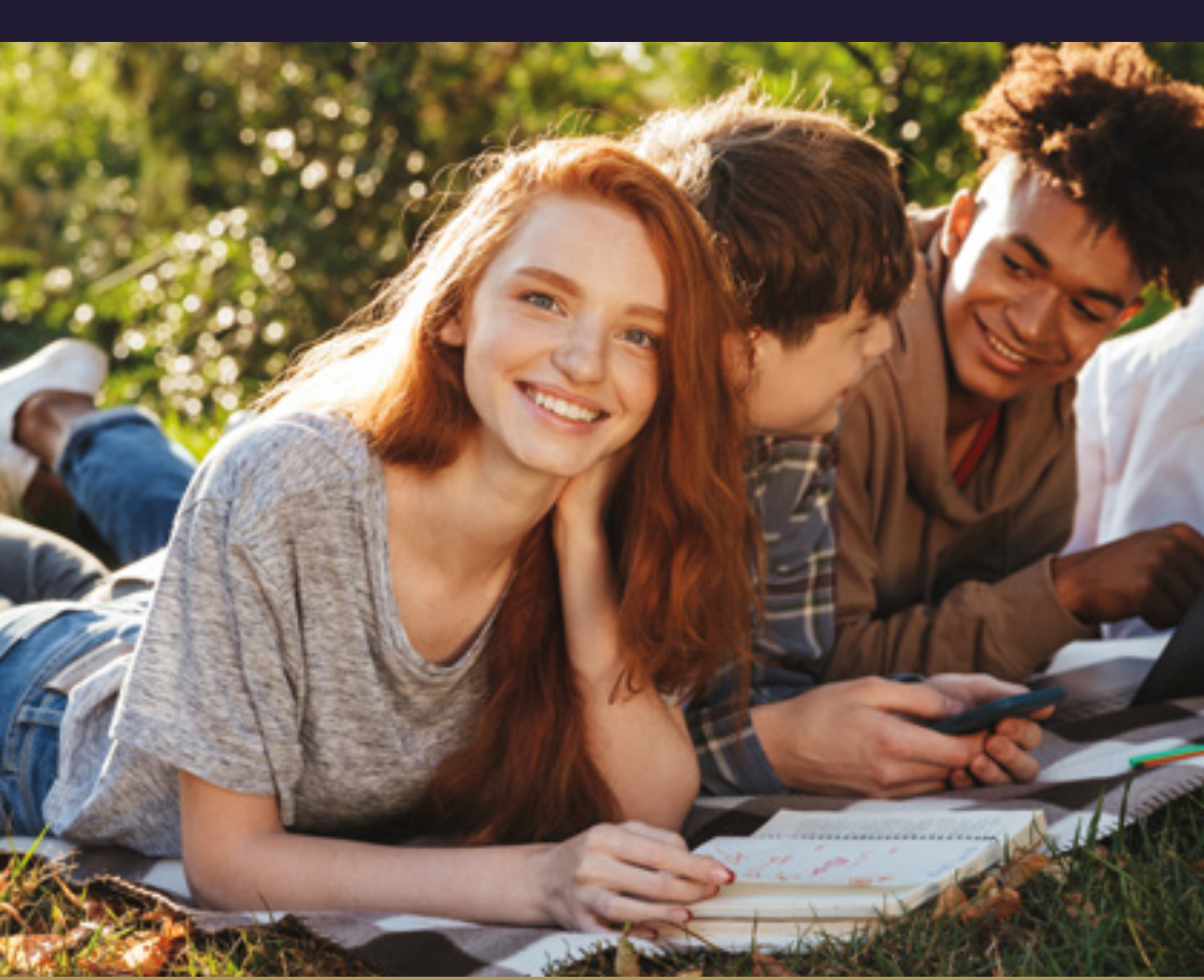
Expert tuition • Fun activities • Relaxed learning