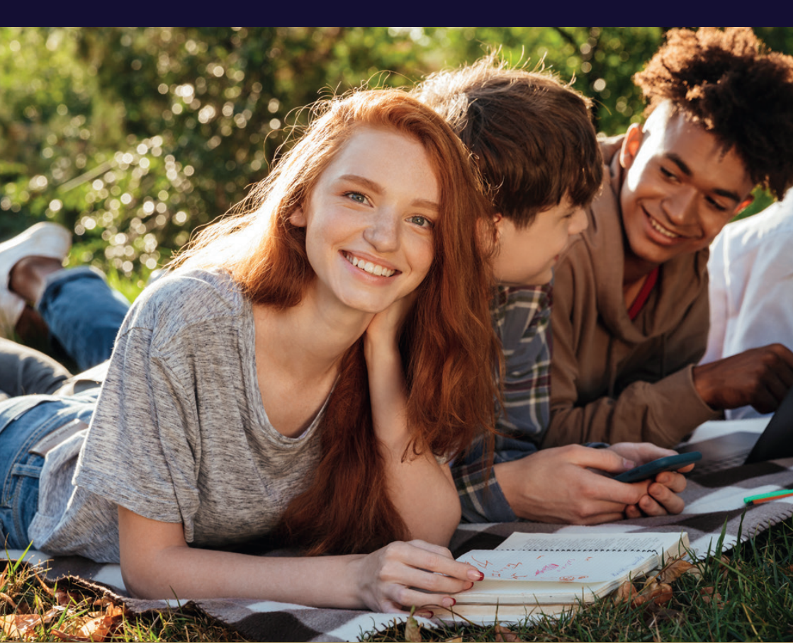
Expert tuition • Fun activities • Relaxed learning